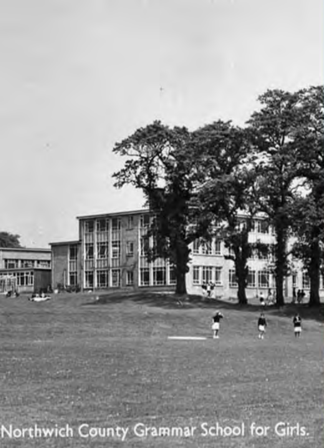
Northwich County Grammar School for Girls.