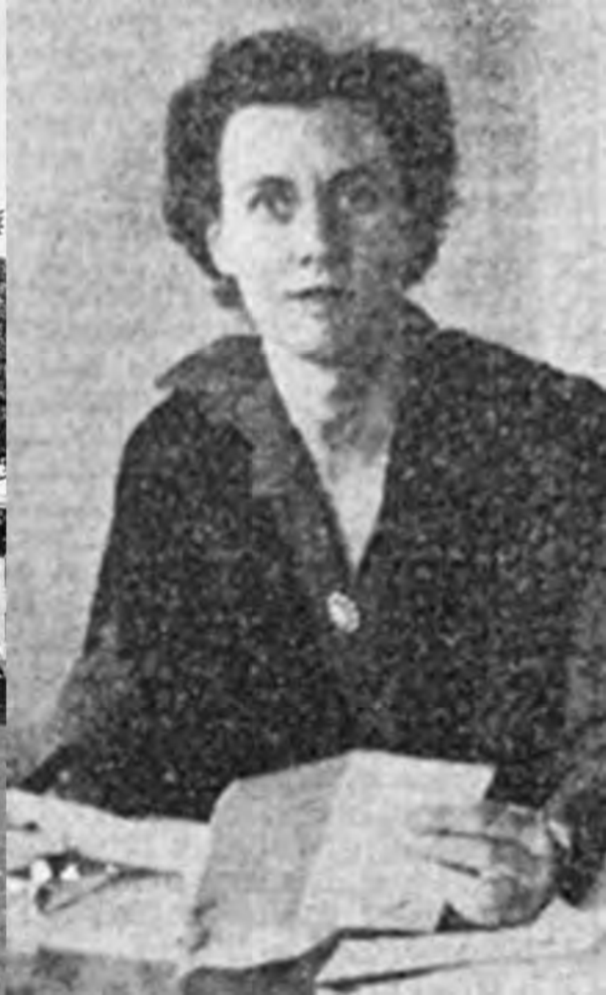
Northwich County Grammar School for Girls.