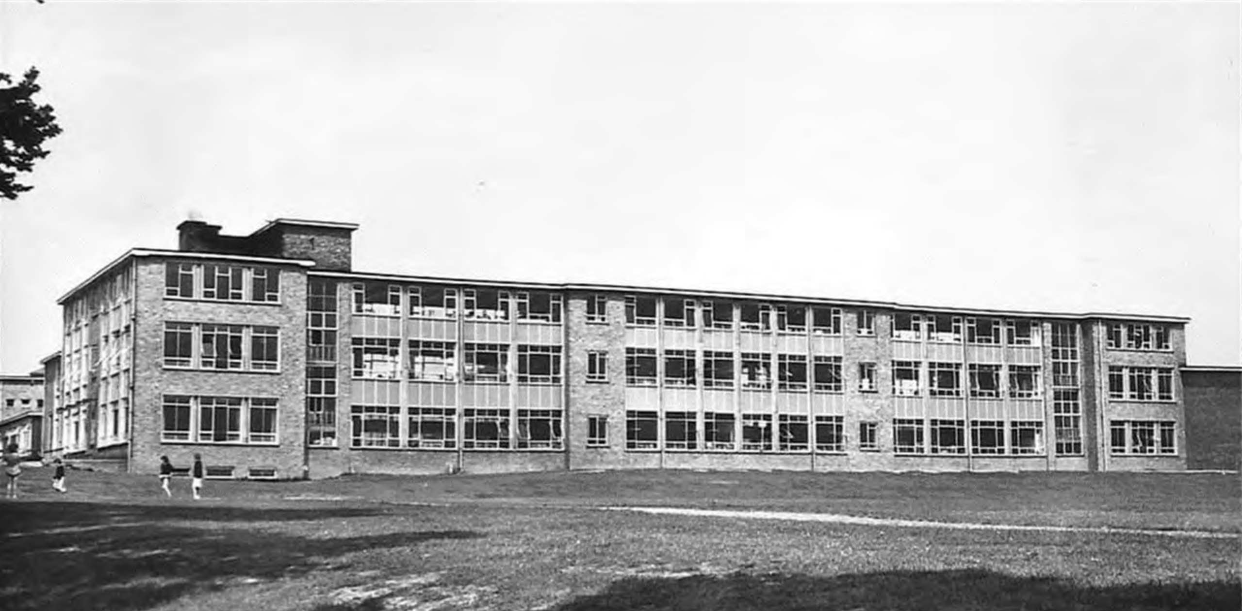
Northwich County Grammar School for Girls.