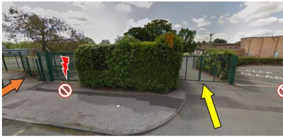
Site access for Reads. No entry for PE entrance or staff car parking.