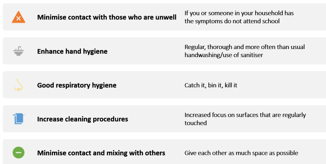
Table 5 – System Control Measures Reminder